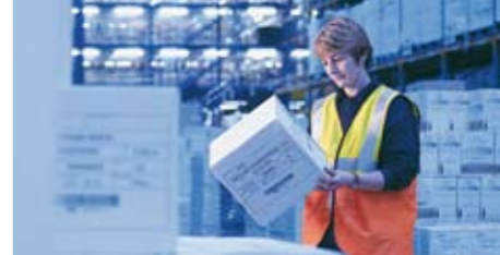
B-SX4 & B-SX5