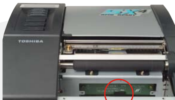
UHF RFID antenna